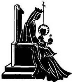
OUR LADY OF MERCY

Hicksville, New York 11801 516-931-4351 Visit us on the web at www.OurLadyofMercy.org