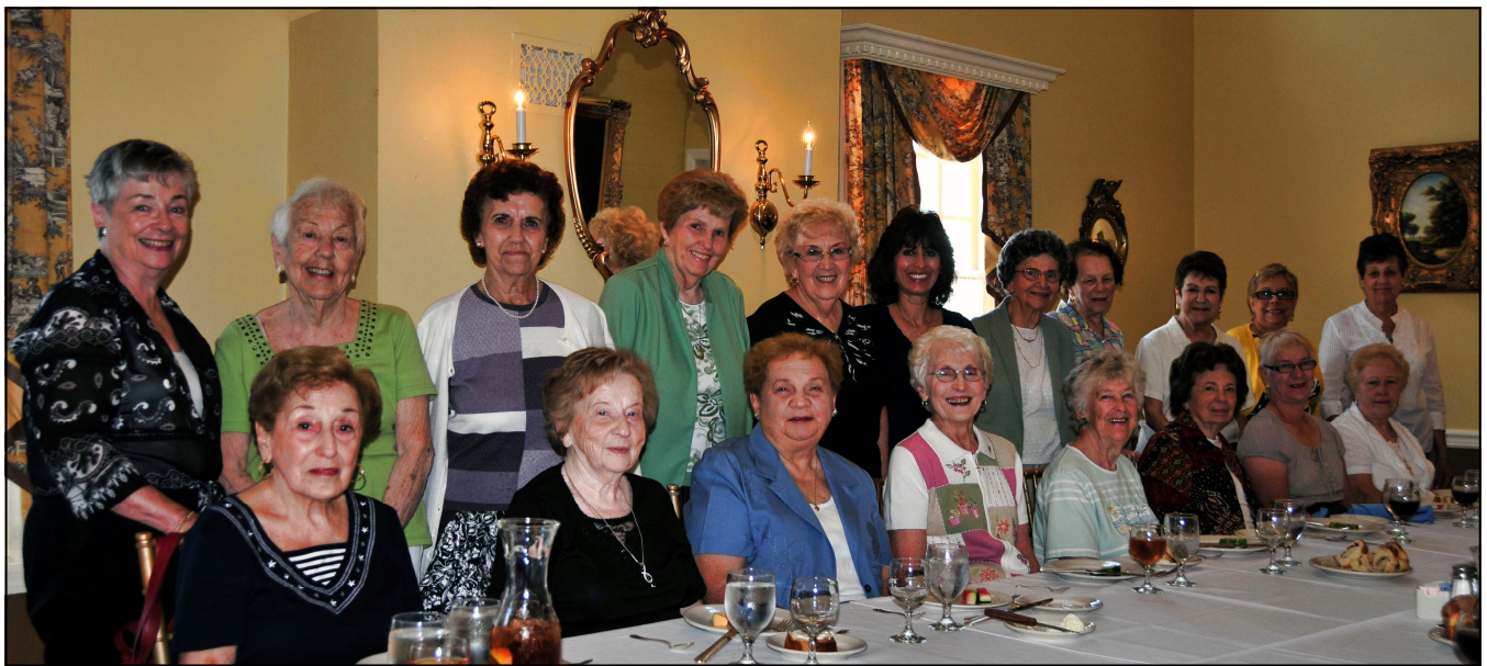
The OLM Boutique Ministry, Giving their Time to Serve the needs of others, and Living our Parish Mission